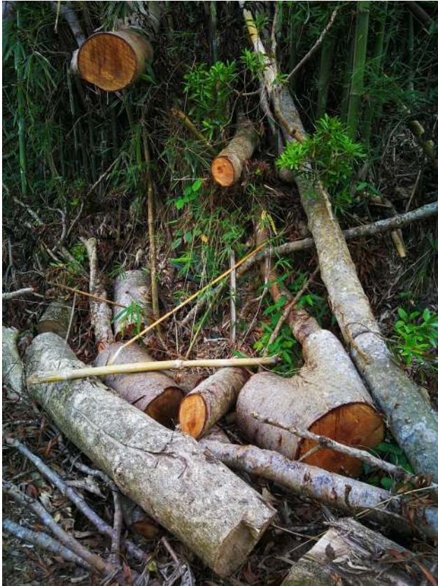
USDA Caribbean Climate Hub