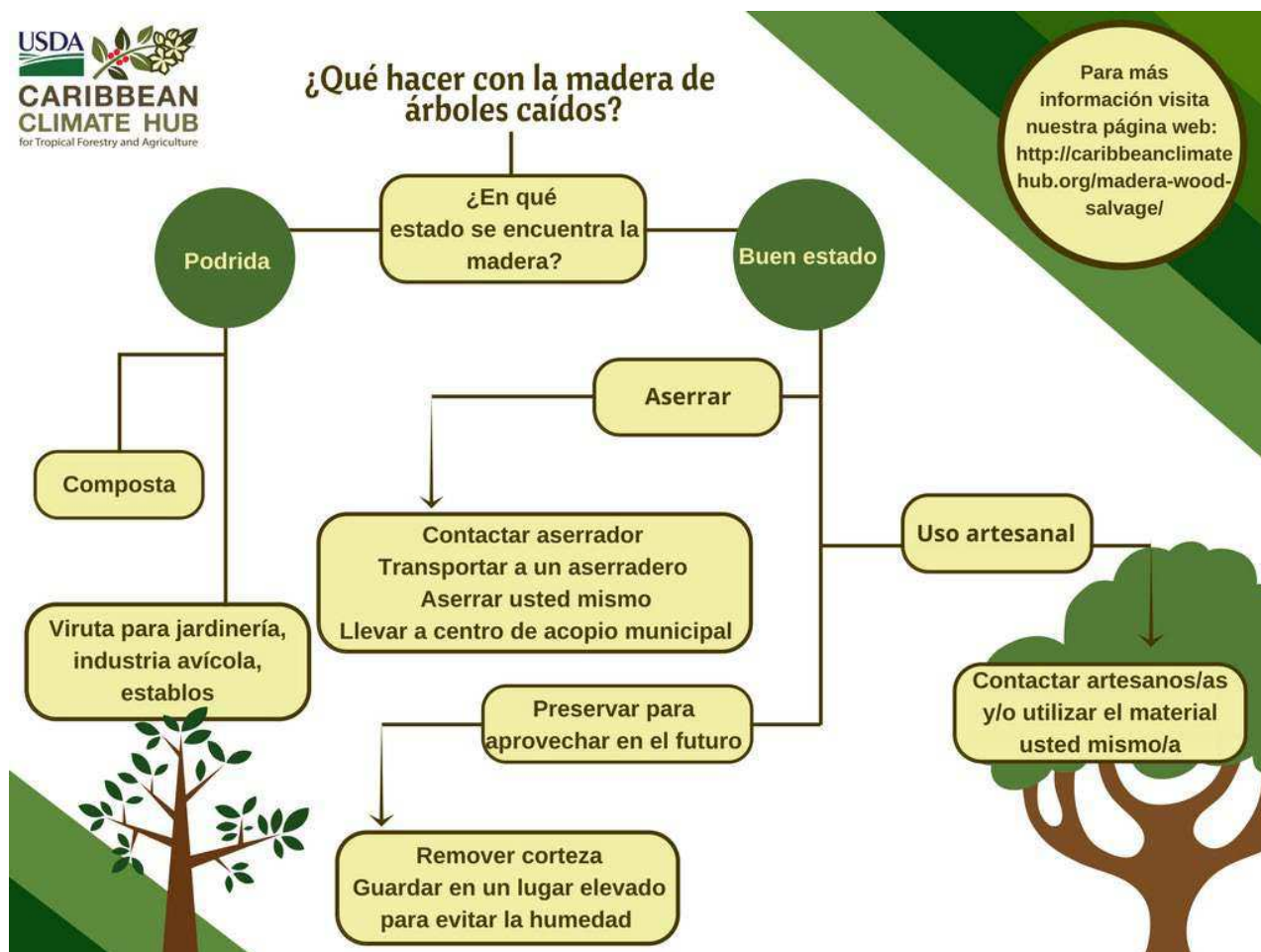
Diagram about wood salvaging:

Educational material is available for download at: